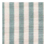
03 Pale Ocean