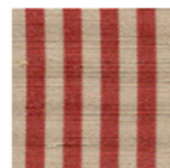
04 Indian Red