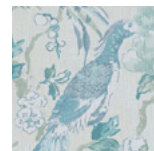
05 Opal (Linen)