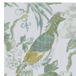
04 Golden Teal (Glazed)