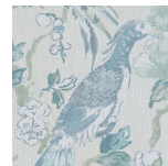
05 Opal (Linen)