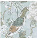
01 Morning Light