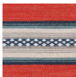
02 Desert Rose