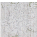
01 White/Grey (Silk)