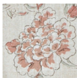
02 Terracotta/ Sage (Silk)