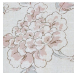
03 Rose/Aqua (Silk)