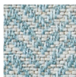
05 Sea Foam