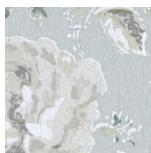
02 Duck Egg On Ecreu