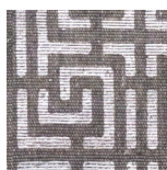
03 Mole + Silver