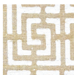
01 Wheat + White