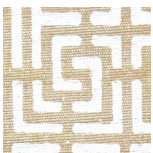
01 Wheat + White