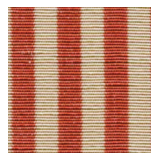
04 Indian Red