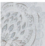
01 Sea Mist