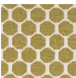
07 Old Gold