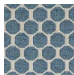
10 French Blue