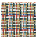
01 Jewel Tones Blonde