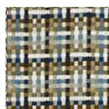
02 Ocean Dune